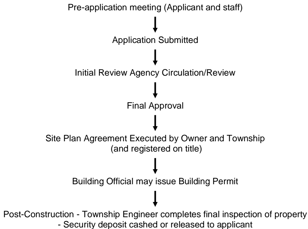
Figure 1: General Site Plan Review Process

The Township will return the balance of the applicant's security deposit when the Township's Chief Building Official or Engineer, as the case may be, has indicated to the Director of Corporate Services, in writing, that all inspections of the property have been completed to ensure compliance with the terms of the Site Plan Agreement. Any works completed on Township property shall be required to be completed and the property returned to its original condition. The applicant will be required to provide any professional reports or 'as-built' drawings to confirm the completion of works such as final grading and stormwater management facilities on the subject property, prior to the return of any applicable security. Partial returns may be released depending on the terms of the agreement.