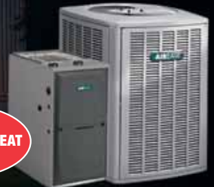
Furnaces & A/C