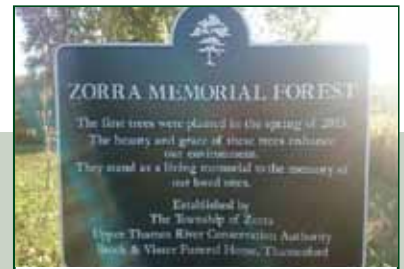
New Memorial Forest Sign!! Located on the 43rd Line, North of Road 68.

Throughout the Township of Zorra there are various tree planting programs available for residents. Available programs are as follows: