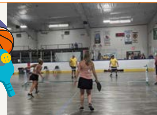
June 1, 2024 Pickleball tournament at the Thamesford District Recreation Centre

The Zorra Multi-Use Committee (ZMCC) is closer to their goal than ever! However, due to increased costs, the fundraising goal for this project has increased from $266,000 to $300,000.