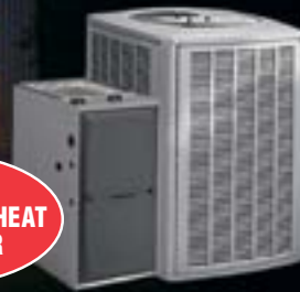
Furnaces, A/C's & Heat Pumps

Electrical • Heating & Cooling • Standby Generator Systems 519.284.0833 St. Marys www.formanelectric.com