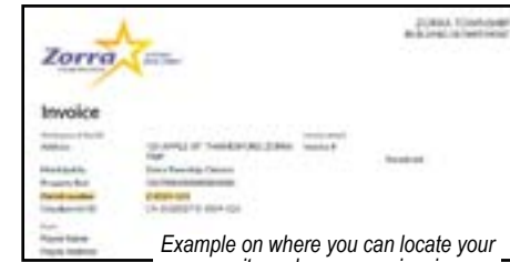
Example on where you can locate your permit number on your invoice